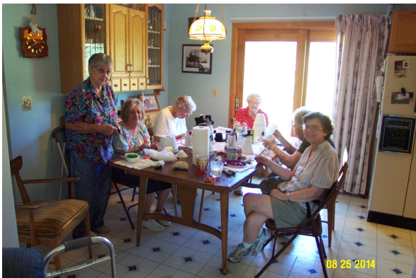
Making flower pot snowmen for Kiddie Bazaar