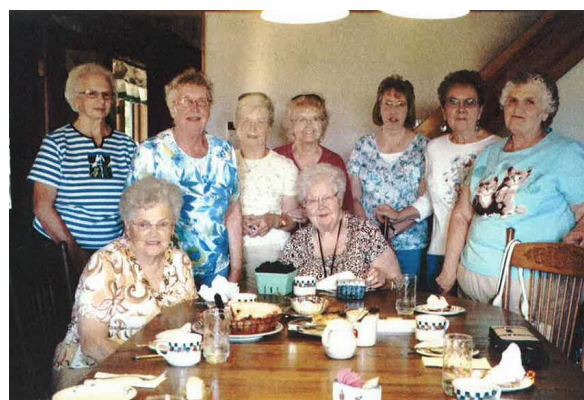
At Boone's Farm where they enjoyed pie and other goodies. They even picked their own blueberries this day.