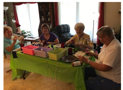
Here are some Chatton pics from a Kiddie Bazaar workday.