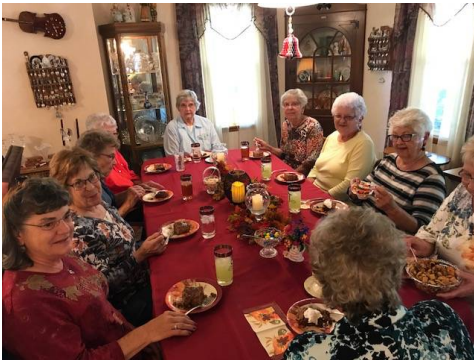
A Chatton meeting