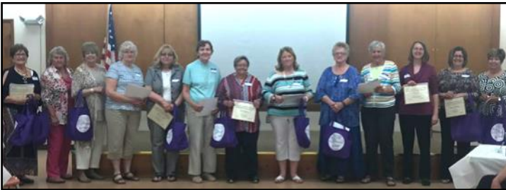
New members and their sponsors

On May 16th, Madison County had their annual membership night in which we recognized all of the new members in the organization and their sponsors. Only a dozen of our new members were present, but we were glad to have them there! Entertainment was provided by The Sixty's Chicks.