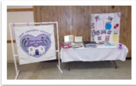
Table displaying awards.

The top six (6) had a combined total of 4,049 volunteer hours. The friendly competition between Adams County and Pike County HCE continues ... thus Pike County kept Pricilla, the rubber chicken for the coming year. The Walk Around Adams County accumulated 14,009 miles reported by 28 participants.