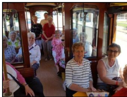
JLT members riding the trolley in Petersburg