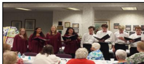
Grant High School Barbershop Quartet

For the entertainment, we had High School students from Grant High School, Barbershop Quartet. They sang a variety of songs and everyone enjoyed it. They were excellent!!!