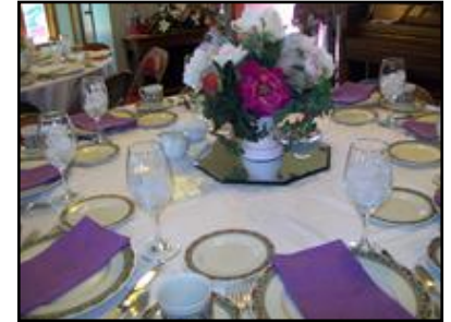
One of the eight beautifully decorated tablescapes.