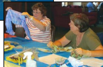
Pictured right: Simple art of designing and coloring white silk scarves.