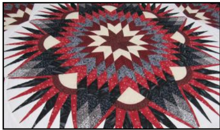
Amish Quilt - tickets are $1 each or 6/$5

All Hands are on Deck and meeting Down by the Riverside in Petersburg this September 16 th for the Petersburg Harvest Fest. This year SCAHCE is moving their festival to the square in Petersburg during the Harvest Fest. This is our main fundraiser and plans are well underway! SCAHCE Harvest Fest will include a gift boutique, attic treasures, bake sale, lunch and outside vendors. We also have two members giving demonstrations – making lye soap and the history of pot holders.