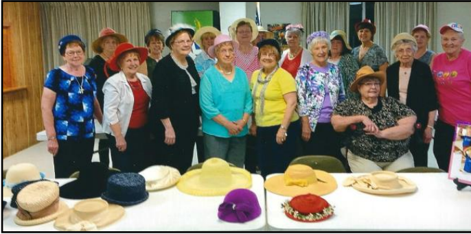
At the Annual Meeting, members wore their hats.

Another program we had was on sewing techniques and tips. A high school home ec teacher presented this and yes - she does teach sewing in the area high schools. These young people are interested in learning to sew and they usually sew pillows. We learned how to hem jeans leaving the original hem on.