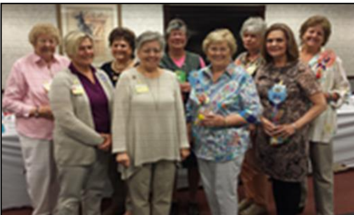
LAKE COUNTY HCE BOARD