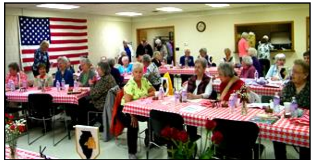
A snapshot of some of the ladies at the annual meeting.