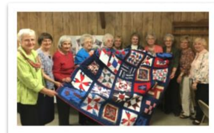
Quilt League Members with Quilt of Valor