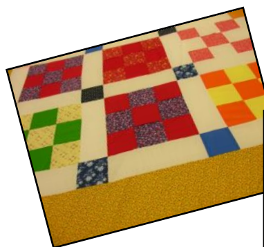
Close-ups of blocks made