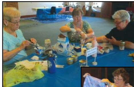
Pictured left: Making body scrub and lotions at Craft Day.