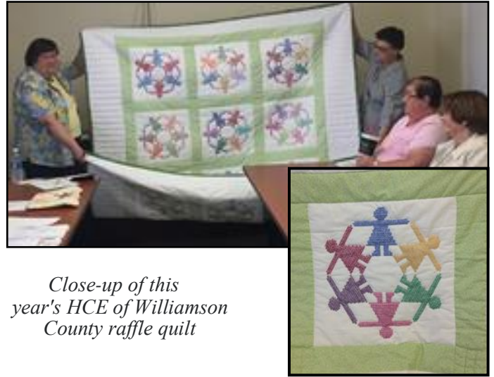
Close-up of this year's HCE of Williamson County raffle quilt

homeless families and individuals. Flood damage there has caused damage that will be repaired this month.