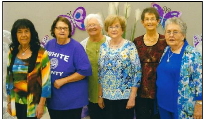
WHITE COUNTY HCE BOARD