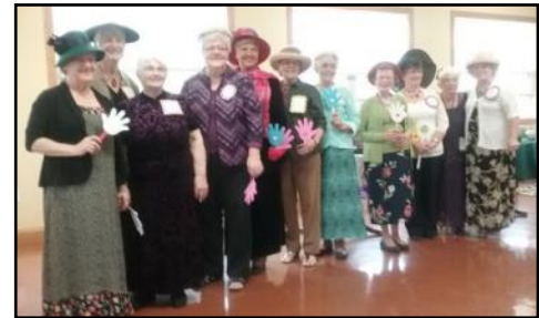
2017-2018 WOODFORD COUNTY BOARD