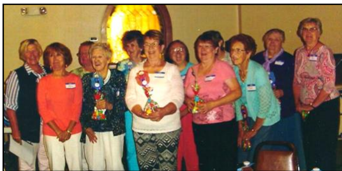
2017-2018 ROCK ISLAND HCE BOARD