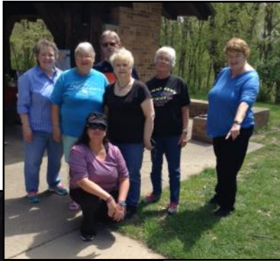
Six women and two men participated in Vermilion HCE Women Walk the World

There were maps showing these countries. A display board had information about ACWW, Pennies for Friendship, and ACWW projects. Twenty-one dollars and fifty-five cents were collected for Pennies for Friendship.