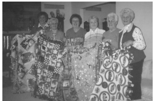
Ladies with some of the finished blankets.

More than twenty members of LaSalle HCE group enjoyed making fleece blankets to donate to local organizations. Blankets were cut and tied in various sizes and patterns for babies to adults. We ended up with 41 blankets and distributed them between Red Stocking, Red Cross, Department of Children and Family Services and other charities.