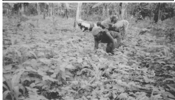
Some of the Beneficiaries working in the field.