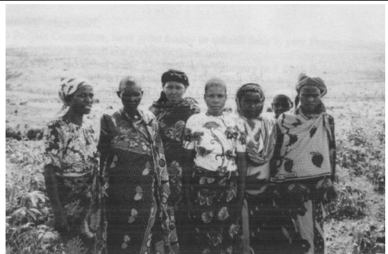
Beneficiaries of the Agricultural Project