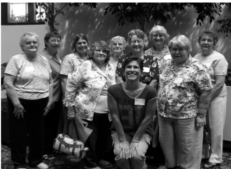
District Meeting at Mt. Vernon August 21

Holiday Ideas Day will be November 6 with the theme "Snowflakes."