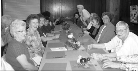
St. Elmo's International Event

I have been visiting counties in the state for their International Events and have been speaking about Belgium (and in one county I spoke on Spain). I have picture presentations for both. I have been to 11 counties since last state newsletter and will be going to a few more soon. If you need any help with your International Event, please let me know. The counties I have visited have made me feel so welcome. I really appreciate that warmth and hospitality. Thank you!