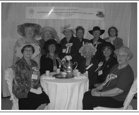
Edgar County after our Tea Party!