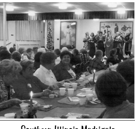
Southern Illinois Madrigals

Holiday Ideas Day theme was "The True Meaning of Christmas". A showing of special quilts and nativity scenes came first followed by a meal and presentation by 4-H Federation on candy making. The Southern Illinois Madrigals were our musical entertainment. A local florist demonstrated how to make inexpensive centerpieces The quilt raffle concluded the evening. The money will