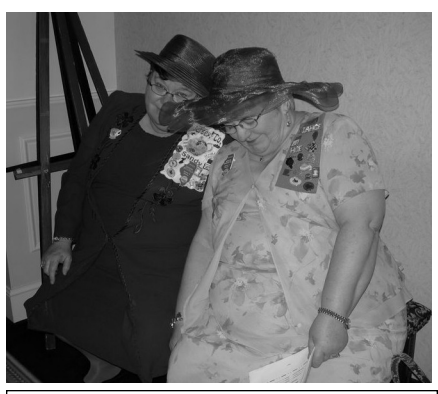
Conference Chairs and it is only Tuesday afternoon!